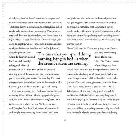
FIGURE 4: Text wrapped around a pullquote.

New Escapologist has only once published poetry; this was in Issue Two where Robert included two poems by Edward Lear. This provided me with an opportunity to make use of the more elaborate ligatures provided by the font Jenson: I made use of ſt , ct and Jenson’s ornate variant of Q: Q̇ . While distracting in prose, these ligatures added a typographical flourish to the poetry. T E X macros provided a natural way to robustly implement the complex indenting