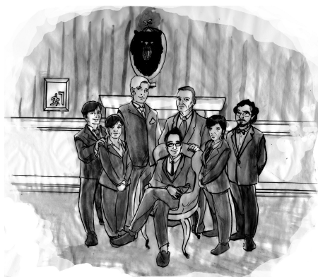
FIGURE 5: The house staff of New Escapologist , as illustrated by Samara Leibner. I stand third from the right.