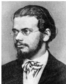
Ludwig Boltzmann (1844–1906)

Der zweite Hauptsatz der mechanischen Wärmetheorie Lecture at the Festive Session, Imperial Academy of Sciences