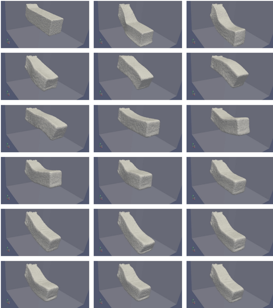
Fig. 3. Oscillating beam. Shape of the beam at time steps 3, 6, 9, ..., 54.