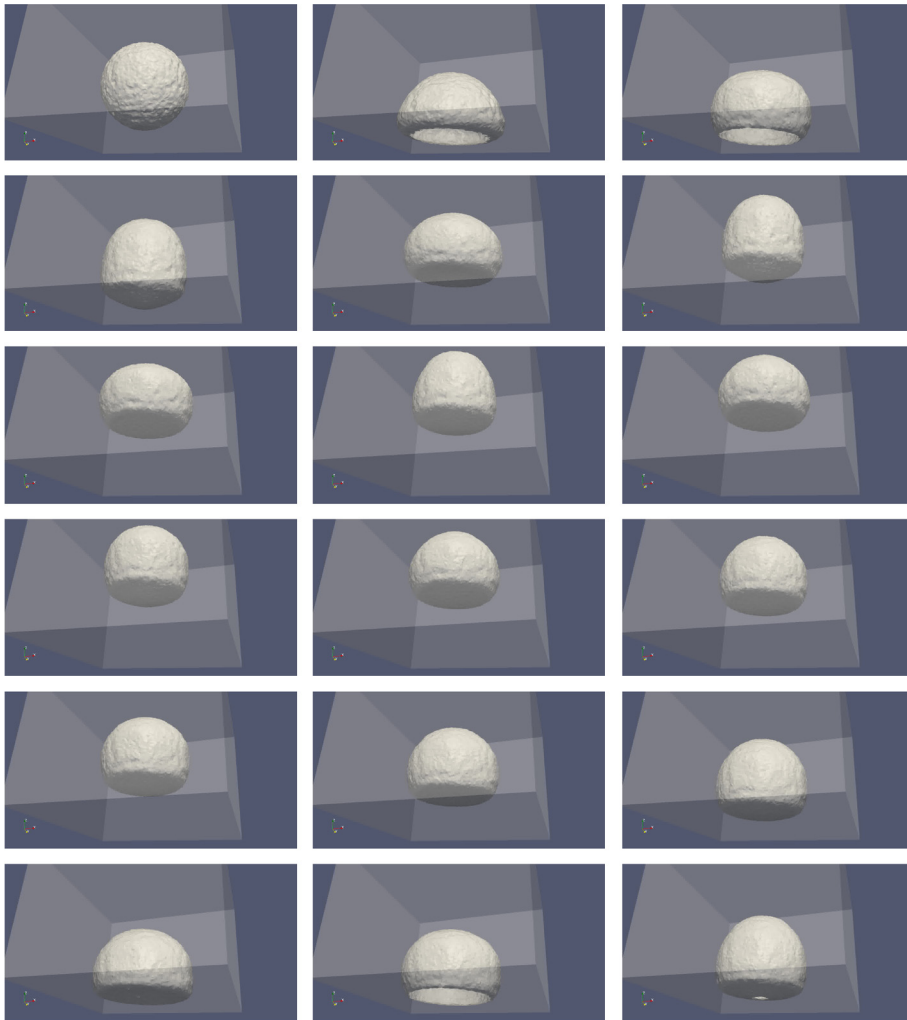
Fig. 1. Ball bouncing. Shape of the deformed ball at time steps 30, 60, 90, ..., 540 (time 0.75, 1.50, 2.25, ..., 13.5).